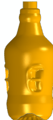
Deformed bottle at 39psig